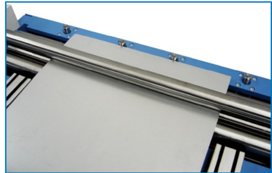
Fig: Sheet metal stop, pneumatically